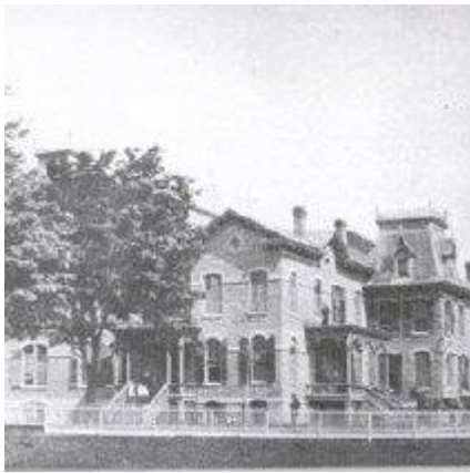
Figure 1 Saratoga County Alms house: Photograph from the collection of Saratoga County Historical Society at Brookside Museum

In the workshop, we are going to try to determine what we can find out about people who were residents of the Saratoga County Poorhouse in Milton circa 1900. The list of residents was kindly supplied by Lauren Roberts.